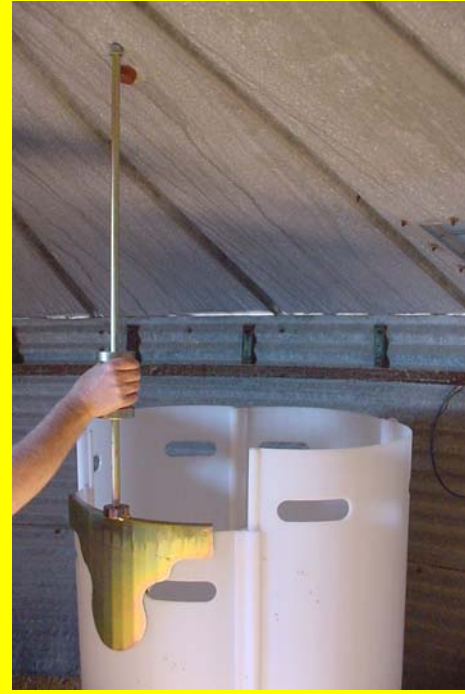
Driver action on tube sheet