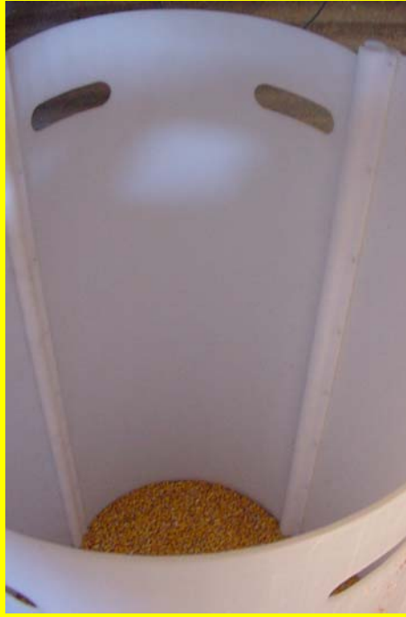
View inside assembled tube