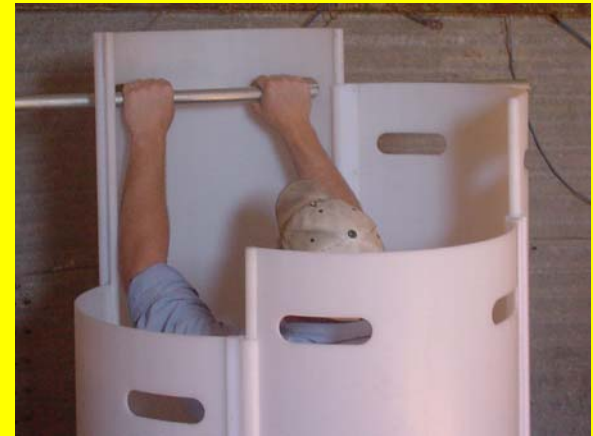
Support handles for victim