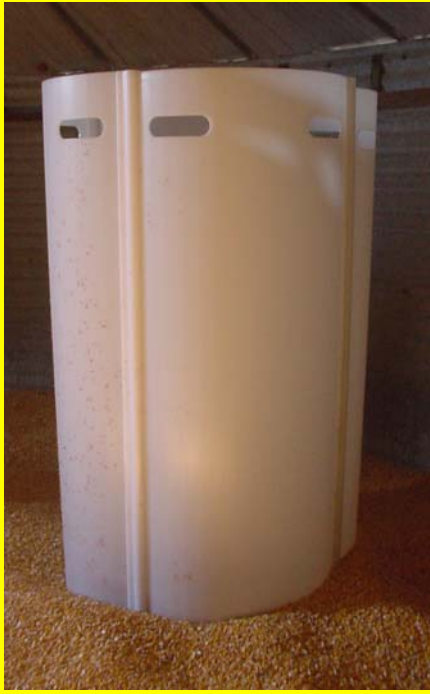
4-section tube assembled