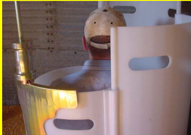
Patented driver unit