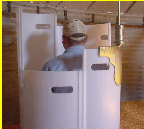
Driving of tube section